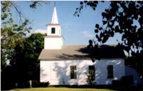
Mason Congregational Church was completed in 1837 on Valley Road

First known as Number 1, Mason was the first in a line of border towns that was part of the area allotted to NH by Massachusetts upon its' establishment as a separate state in 1741. The town's charter was granted in 1749, and in 1768, Governor John Wentworth named it in honor of New Hampshire's founder, Captain John Mason. Captain Mason was the holder of patent with title to the land that became New Hampshire.