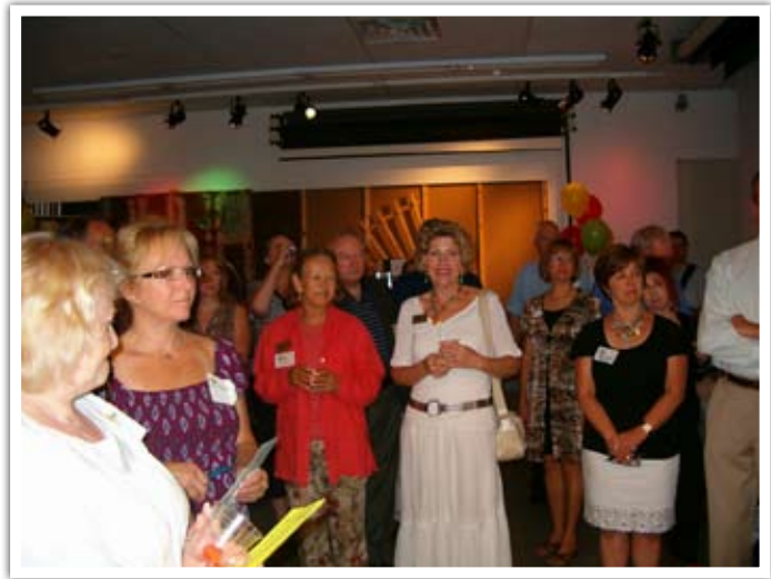
Souhegan Valley Chamber Referral Group hosted the July After Hours at CIM Photography.

It is our hope to continue to grow the SNH Expo and that the result will provide a regional stimulus and interest that will bring much deserved attention to the wonderful companies, professional service providers and the food and beverage offerings of our area. Customers in our region routinely travel from one community to the next to do business. Our experience is that they search for opportunities to patronize local merchants and professionals. Are you one of the businesses they are looking for?